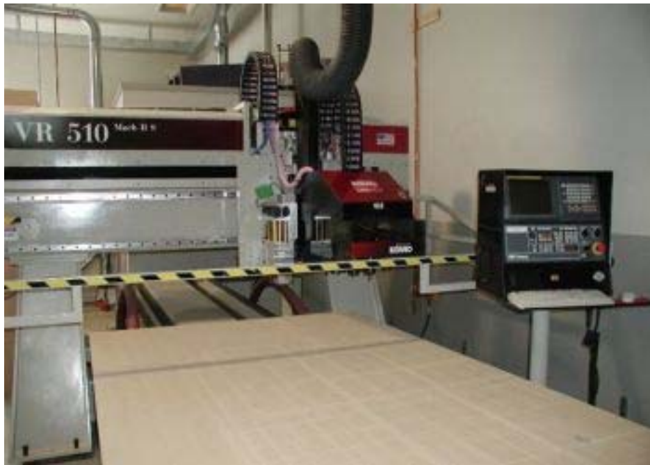
Quarter Point Woodworks